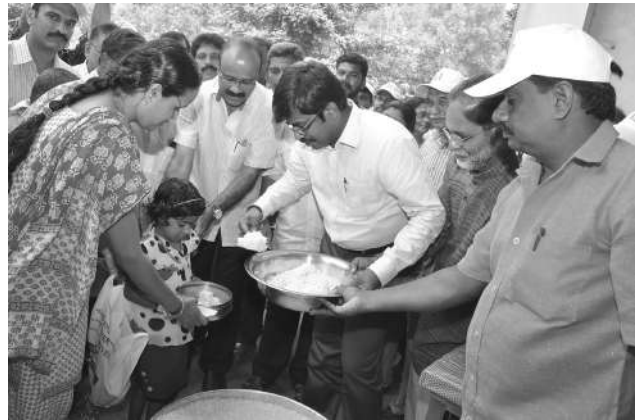
Food Serving by MG Rajamanickam IAS