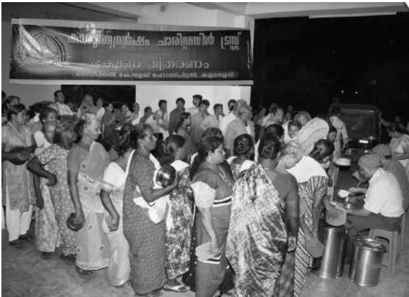
Food Serving by Vincent De Paul, NGO Quarters