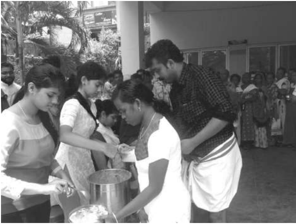
Food Serving by KCYM Kalamassery