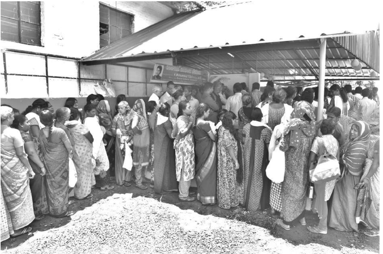
A scene from the inaugural day food supply at our “Hospital Without Hunger” project at Government Medical College Hospital, Ernakulam