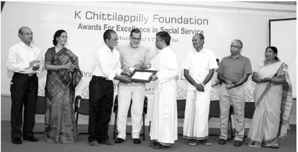
Karunyavarsham was awarded for Excellence in Social Service for the year 2015-16 by Kochouseph Chittilappilly Foundation