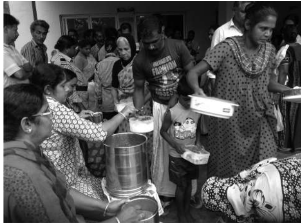
Food Serving by Women Welfare, Changampuzha Nagar