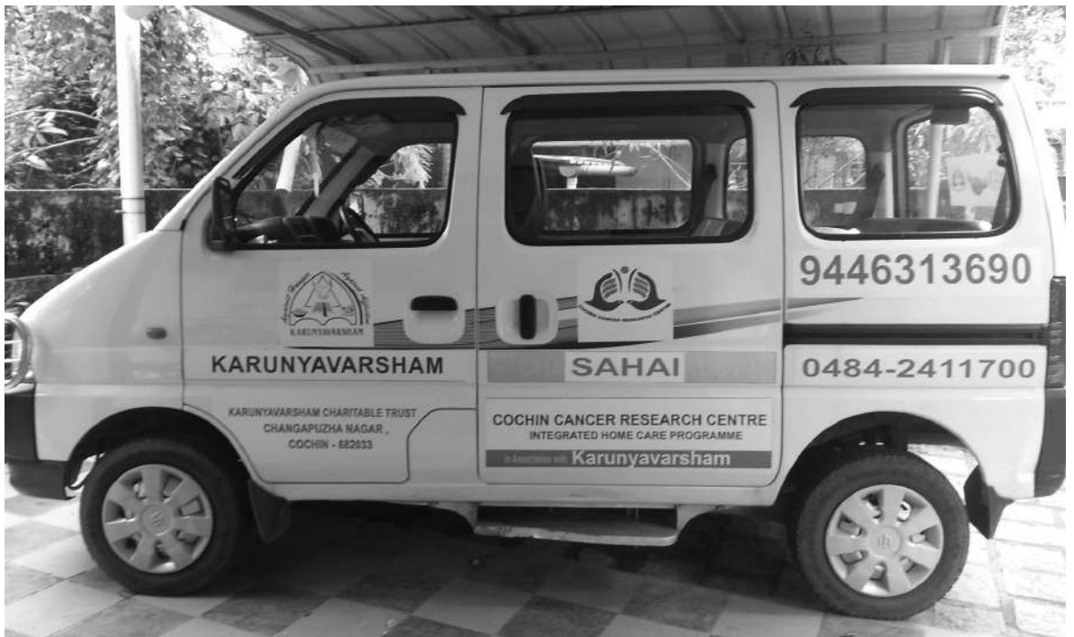
Integrated Home Care Programme